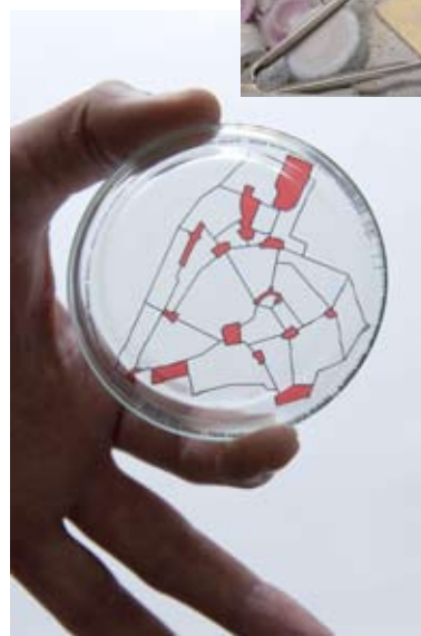
WALKIT, STEFANIJA NAJDOVSKA